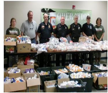
Drug Take-Back Event

To dispose of prescription and over-the-counter drugs, call your city or county government's household trash and recycling service and ask if a drug take-back program is available in your community. Some counties hold household hazardous waste collection days, where prescription and over-the-counter drugs are accepted at a central location for proper disposal.